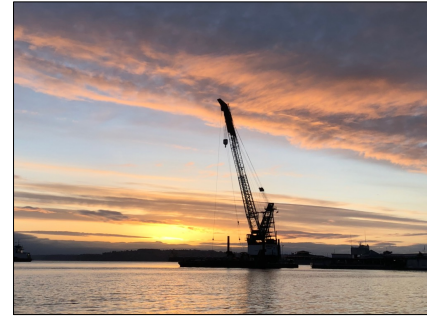
Sunrise from the Point Defiance Park's Owen Beach Boardwalk.