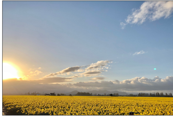
The sun rising over a field of bright yellow daffodils in Skagit Valley, Washington.