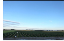
If you look closely, you will see these tulips preparing to make their debut.