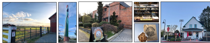
Pictured above L to R: JF Ranch minus the donkeys, the tulip tower, and Calico Cupboard and Stompin Grounds Coffee.