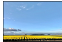
Rows and rows of daffodils.

These new signs obviously didn't stop Rachel from snapping a few photos. As a staunch follower of rules, Rachel had to find a way, and since there are no signs stating one can't stop a car in the middle of the road, well, you get the picture. The beauty of arriving in town while most other humans are still snuggly sleeping in their beds is that the roads are empty. Yes, Rachel stopped her car in the middle of the road to snap photos. Skagit Valley can eat crow. She was very careful and only did this on long, straight roads that went on as far as the eye could see.