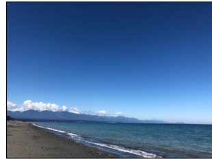
Pictured Top: It was a beautiful day in the PNW for Saturday's adventure.