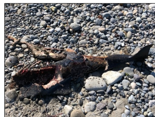
Pictured Below: What remains of a shark that washed up on shore. Rachel got a bit too close and caught a whiff of the rotting flesh. Fascinating find!